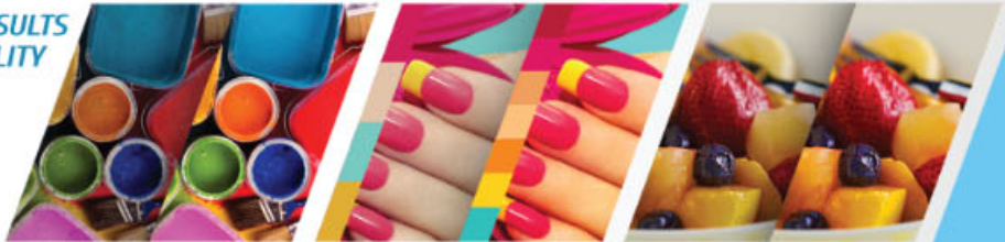
Less mottled effect

THREE-WAY HEATING RESULTS IN SUPERIOR IMAGE QUALITY